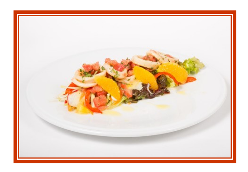
4 – 6 oz. monkfish filets 4 large slices of Pancetta or smoked ham 8 fresh basil leaves Garlic powder Salt and pepper to taste

Lightly season the monkfish and sprinkle a little garlic powder all over the fish. Spread two basil leaves on each filet center. Wrap the filet and basil with the Pancetta or smoked ham slice. Brush with oil and grill for 5 minutes, time may vary based on thickness of the fish. Moisten with oil and turn the fish over. Grill until the flesh starts to flake, approximately another 3 to 5 minutes. Serve immediately with your favorite grilled vegetables, asparagus or salad.