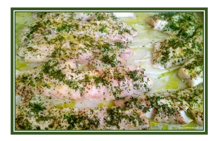
3 lbs. Rockfish filets Garlic powder Salt and pepper Minced parsley or cilantro 2 limes, juiced Olive oil