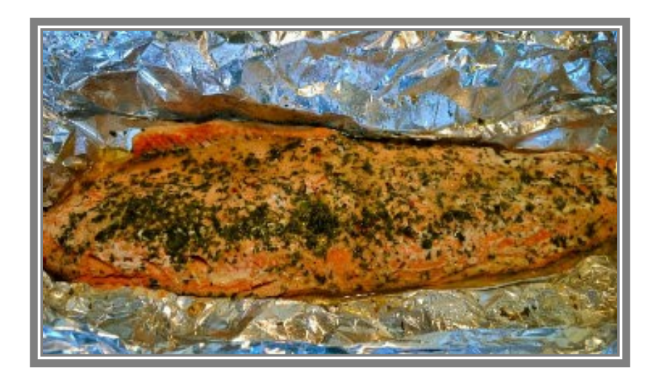
I large wild whole salmon filet I tsp. garlic powder Freshly minced salad herbs I lemon, juiced Olive oil Salt and cayenne pepper to taste