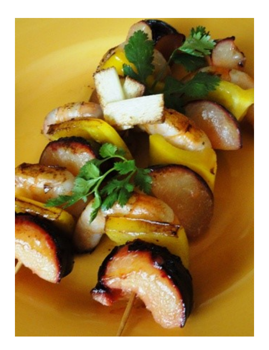
2 yellow bell peppers 3 Tbsp. olive oil 3 Tbsp. lime juice 1" fresh ginger, minced 1 Tbsp. freshly minced Thai basil 2 Tbsp. freshly minced cilantro 1 tsp. lime zest 1 jalapeno, seeded and minced 12 extra-large shrimps 4 plums, quartered Salt and pepper to taste

Cut the yellow bell peppers into the size of the plum pieces. You need to end up with 12 pieces. It is ok to end up with a few extras which you can use for a salad or another side dish. Mix the olive oil, lime juice, ginger, Thai basil, cilantro, lime zest, and jalapeno in a bowl. Season to taste and mix well. Transfer half of the mixture to another bowl. Add the 12 bell peppers pieces, shrimps, plums, and mix. Refrigerate for 20 minutes.