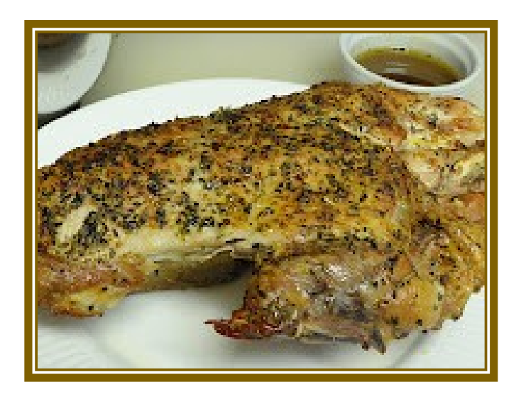
3 lbs. turkey breast 2 tsp. grapeseed oil 2 tsp. dry Italian herbs Salt and pepper to taste