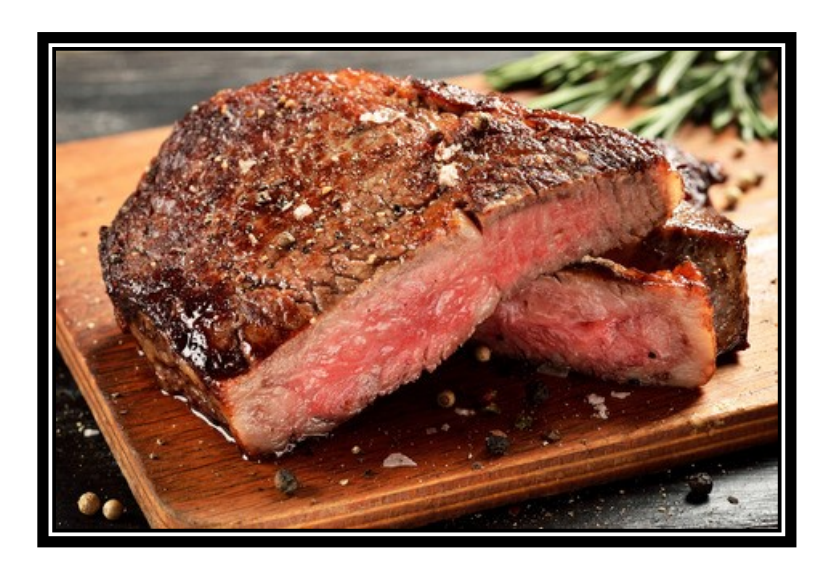
4 Ribeye steaks 1 avocado, seeded and peeled 1 Tbsp. freshly minced parsley 1/2 tsp. onion powder 1/4 tsp. garlic powder 1 tsp. freshly minced rosemary 1/4 cup plain goat yogurt Salt and cayenne pepper to taste

Place the avocado, goat yogurt, parsley, onion powder and garlic powder in a blender. Mix until smooth. If to thick to your like, add a little water or vegetable broth to the mixture until you obtained desired consistency.