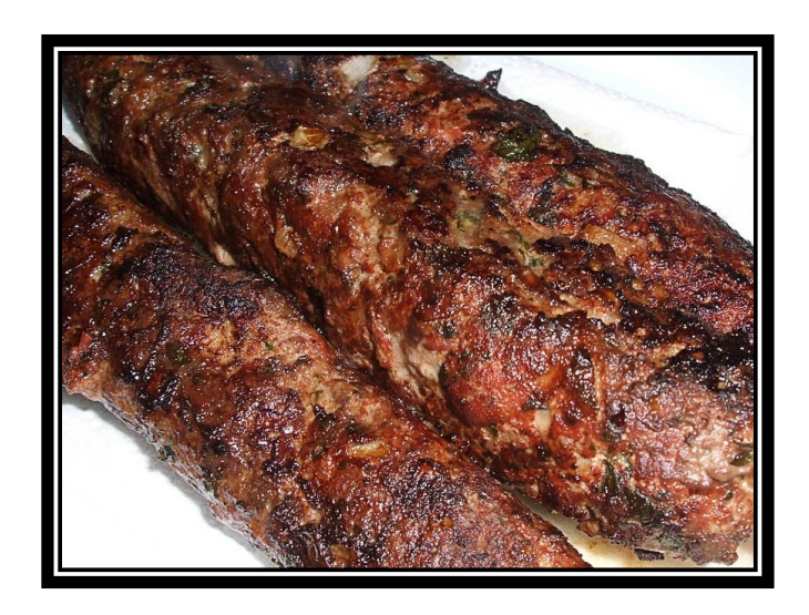
1 lb. ground lamb meat 1 small onion, thinly shredded 1 small carrot, thinly shredded 1 Tbsp. olive oil 1 Tbsp. paprika 1 tsp. cayenne pepper 2 tsp. freshly minced oregano 2 tsp. minced mint leaves 1/2 tsp. salt

Place the lamb meat in a bowl and set aside.