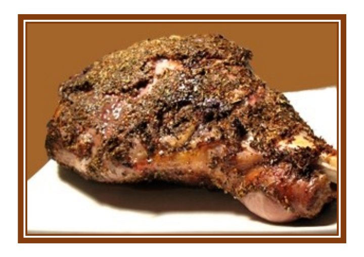
1 leg of lamb (approximately 5-6 lbs. fat trimmed) 4 oz. onions, chopped 2 oz. carrots, chopped 2 oz. celery, chopped 1 Tbsp. of grape seed oil 2 garlic cloves, peeled 2 tsp. dry thyme 1 tsp. dry rosemary 4 large garlic cloves, peeled 2 cups of lamb, beef or chicken stock Salt and pepper to taste