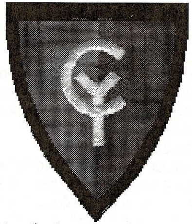
The insignia of the 38 th Infantry Division recently replaced the Michigan Griffin insignia on 107 th uniforms. The division became known as the "Cyclone" Division following a hurricane which killed a unit member.