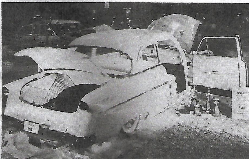
The Rebels displaying their "gold" won in many drag race and car show competitions.