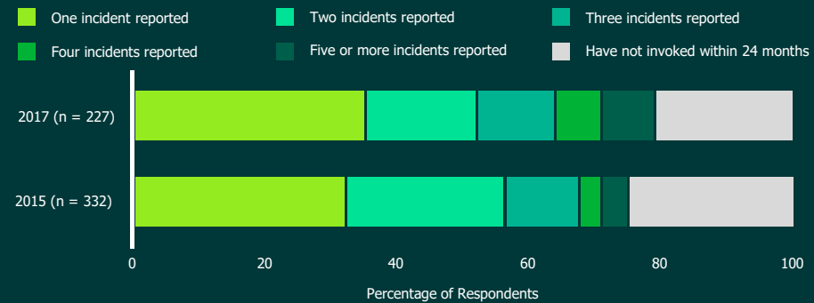
Incidents Requiring IT DR Plans

Base: BCM, excluding those in which activity is not included in BCM program (C01) and excluding "don't know" and "not applicable." Q. For the following activities, how many incidents has your organization had that required the use of a Recovery plan during the past 24 months? ID: 344045