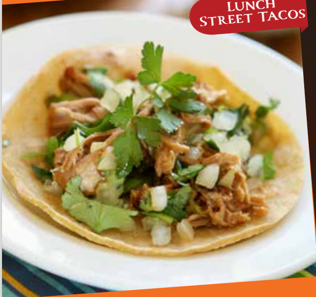
LUNCH STREET TACOS

Two soft corn tortillas with choice of steak, chicken, chorizo, shrimp or pork with cilantro, onion and hot sauce - 8.99