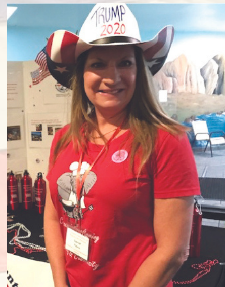
A true patriot and Daughter of the American Revolution