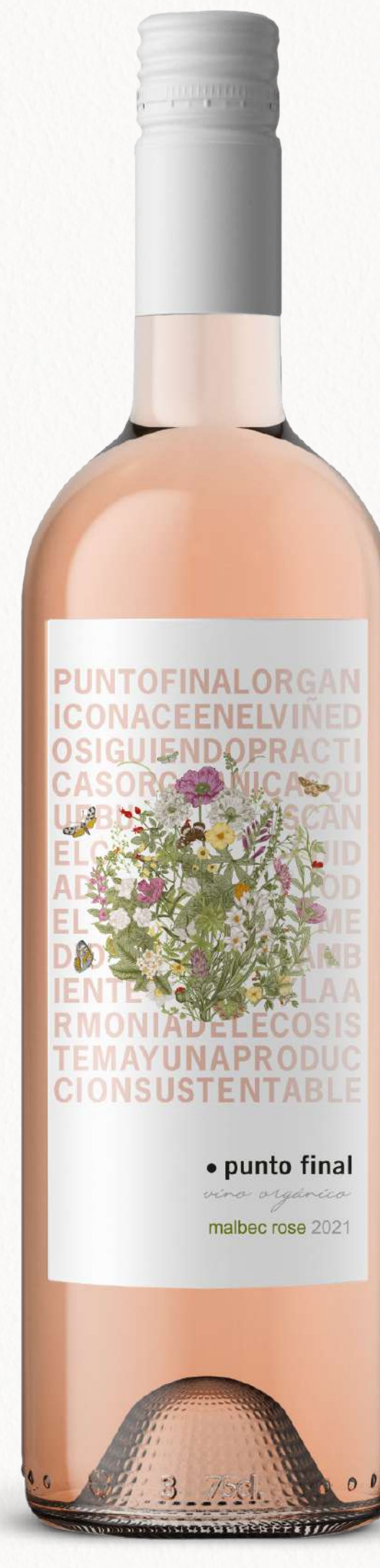
Punto Final Malbec Rosé Organic