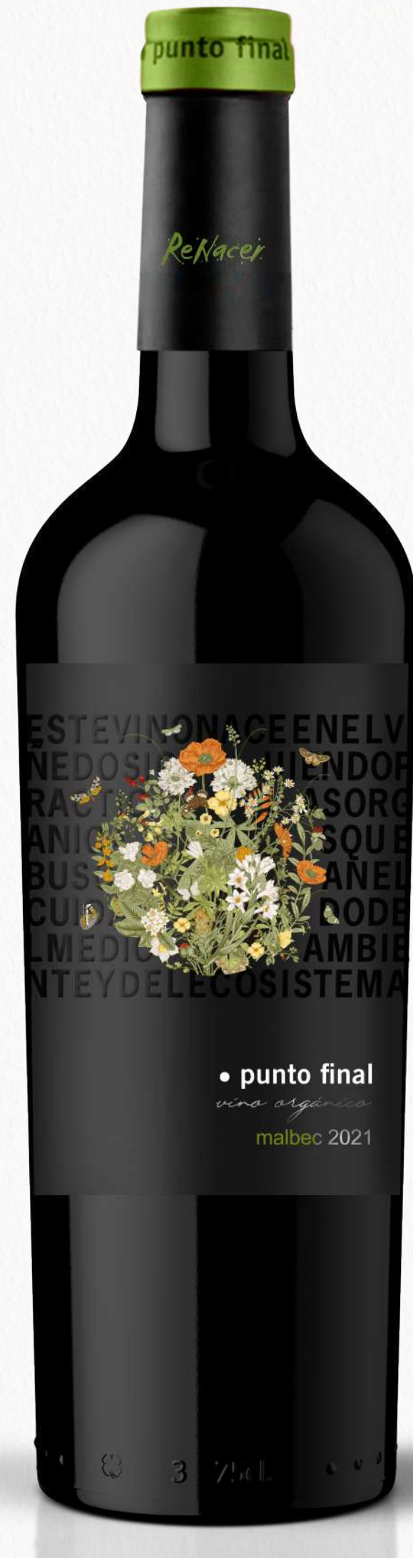
Punto Final Malbec Organic