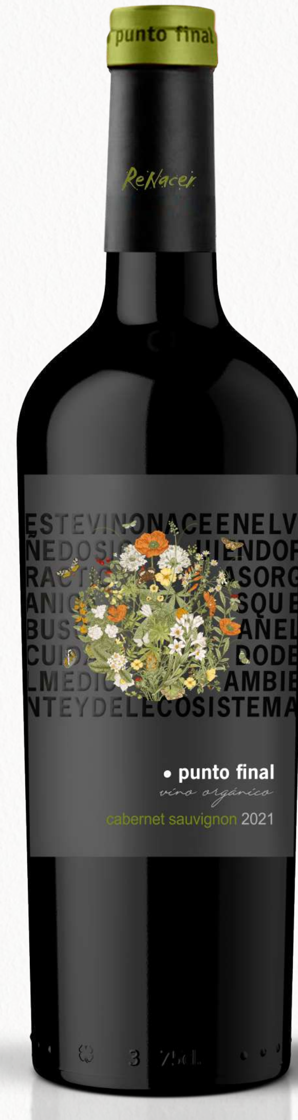
Punto Final Cabernet Sauvignon Organic