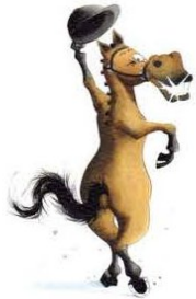
Smile for the Judge

The next couple of months WDHA has many planned events, mark your calendars for WDHA meeting, May 19th at Rolling Meadows in Fondulac Badger Classic, May 25th - 27th at Jefferson WDHA Sporthorse and Dressage, June 21-22 at West Bend WDHA Open/Futurity-Maturity Festival, September 8th-9th at Oshkosh. See attached the full calendar of events for 2018 with perhaps more to come.