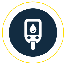
TYPE 2 DIABETES

Lack of sleep is linked to several chronic diseases and conditions, including: