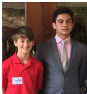
Berry Middle School recipients: