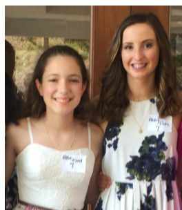
Simmons Middle School recipients: