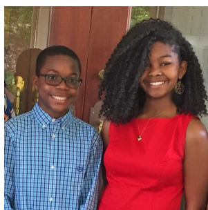
Bumpus Middle School recipients: