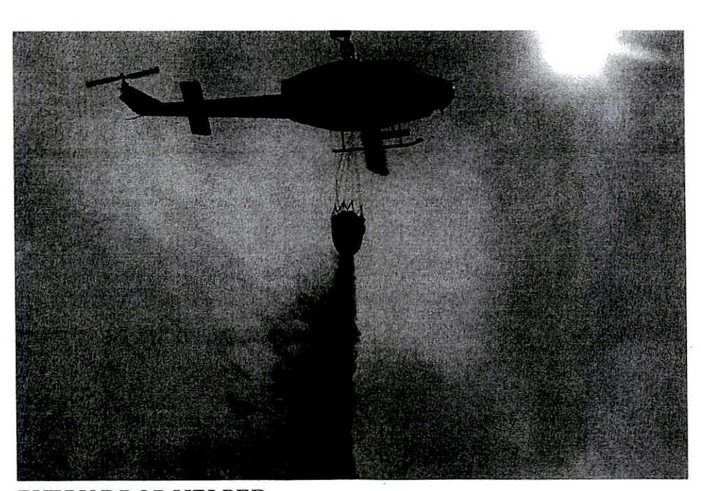
EVERY DROP HELPED