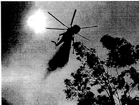
Dropping "black" water

were blowing too hard but there he was rising up slowly and moving over towards Curtis and me. He hovered above us about 20 feet high, we looked up and saw the bottom of his