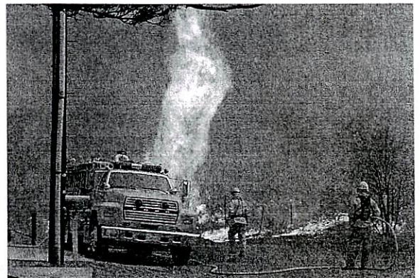
A column of flame beside the fire truck

up onto the engine and handed down a five-gallon container of foam to Chris and asked him to start supplying