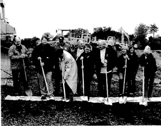
MVFA Board "Breaking Ground"