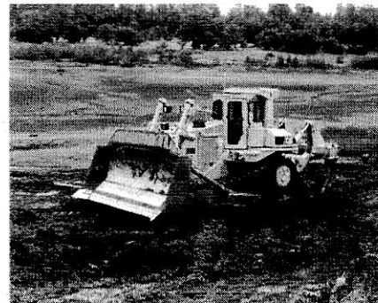
D 9 at work on the Lakebed

Although preliminary work has begun, the initial task was to remove the debris that accumulated on the dam and move it out of the way. When the dam is rebuilt, most of this foreign matter must be avoided in order to achieve the soil compaction required.