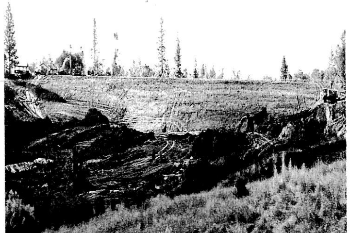
Working on Slide Gate Support