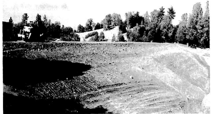
Panorama of Finished Dam