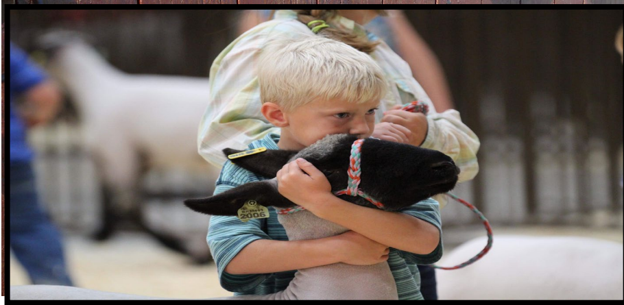
Direct Operating & Ownership