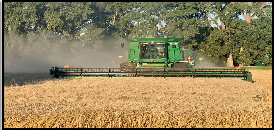
Guaranteed Operating & Ownership