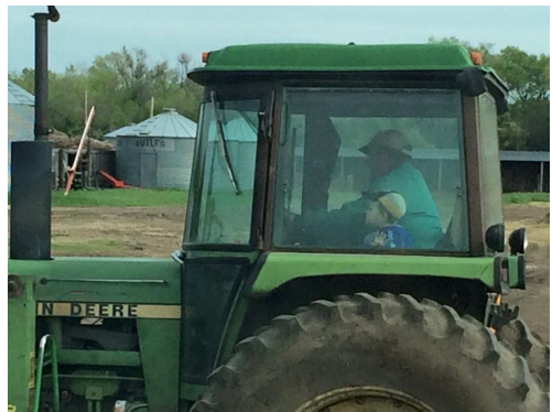
We want to see all of the next generation! Please send photos to