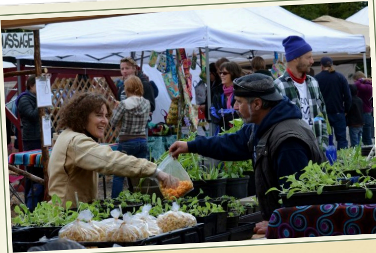
ALASKA GROWN LOCAL FOOD - GOOD FOOD