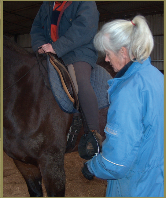
FIGURE 11 Adjust stirrups