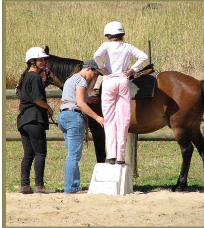
FIGURE 14 Mounting