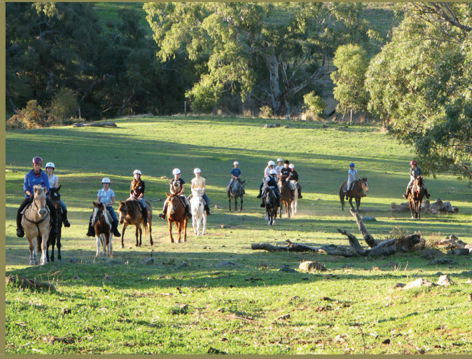
FIGURE 8 Riding in the open