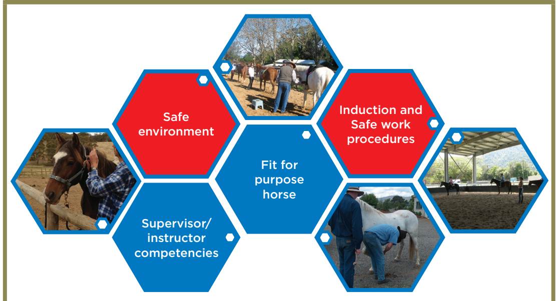
FIGURE 1 Key aspects of managing risks