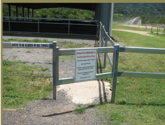
FIGURE 2 Barriers to control access to horses