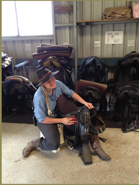
FIGURE 10 Saddle cleaning