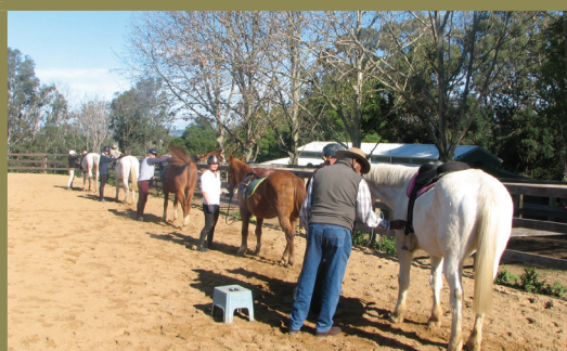
FIGURE 4 Line up for mount