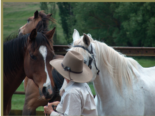
FIGURE 13 Catching a horse in a group