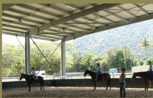
FIGURE 6 Enclosed area with fencing