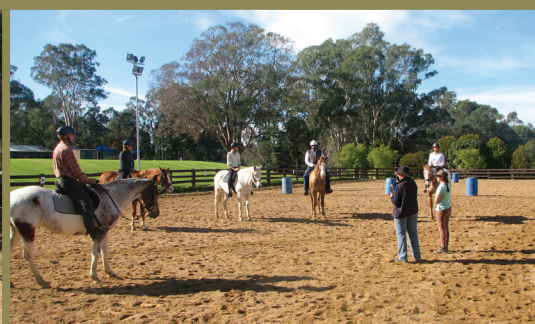
FIGURE 5 Instructor training