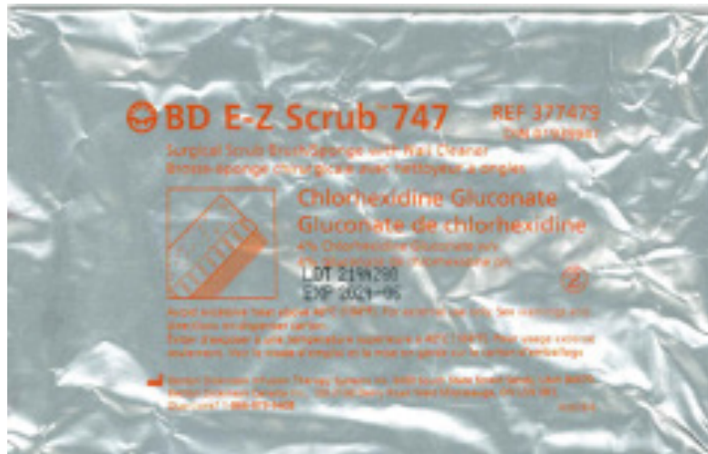
A photo of a CHG cleaning sponge in its package

Chlorhexidine Gluconate (CHG) cleaning sponges clean the skin before your C-section. Cleaning the skin this way lowers the risk of illness caused by germs in the area.