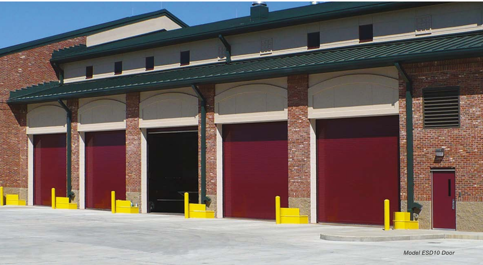
Model ESD10 Door