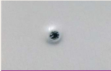
Figure 3a – VESTAKEEP® PEEK