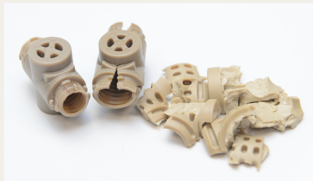
Figure 2 – Spindle nuts comparison

For more information please visit our website www.vestakeep.com