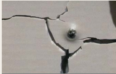
Figure 3b – Competition PEEK

VESTAKEEP® PEEK shows ductile fracture behaviour due to a higher energy absorption ability, arresting further crack propagation (see Figure 3a).