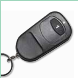
TR-1 Single button transmitter