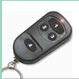
TR-4 Four button transmitter