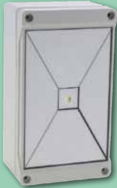
RBH-FR-4000 Receiver (IP66 compliant plastic enclosure)