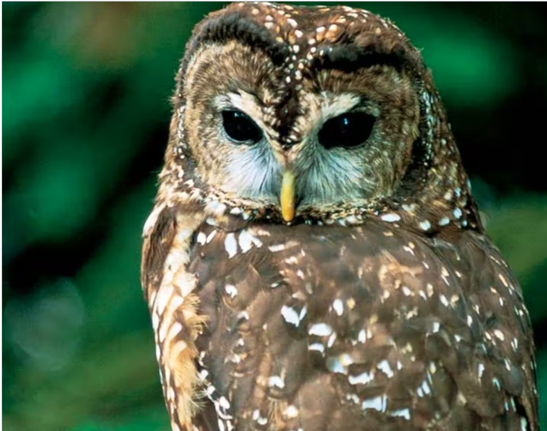
The northern spotted owl, a critically endangered species in B.C.

Tiffany Crawford · Postmedia News | Posted: 15 hours ago | Updated: 15 hours ago | 4 Min Read