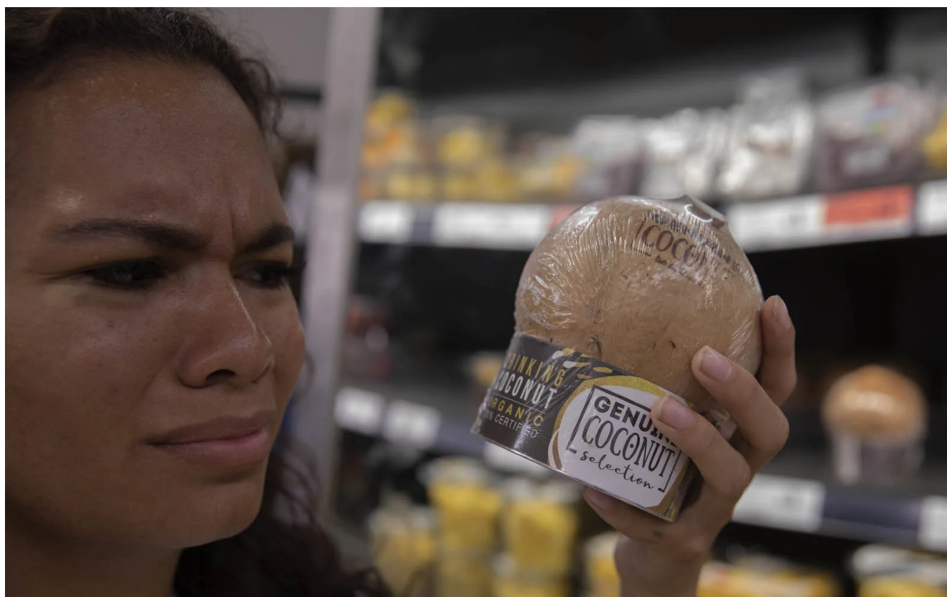
A group of major plastic companies are suing the federal government to try to prevent a ban on some single-use plastics.

#25 of 25 articles from the Special Report: Canada's plastics problem