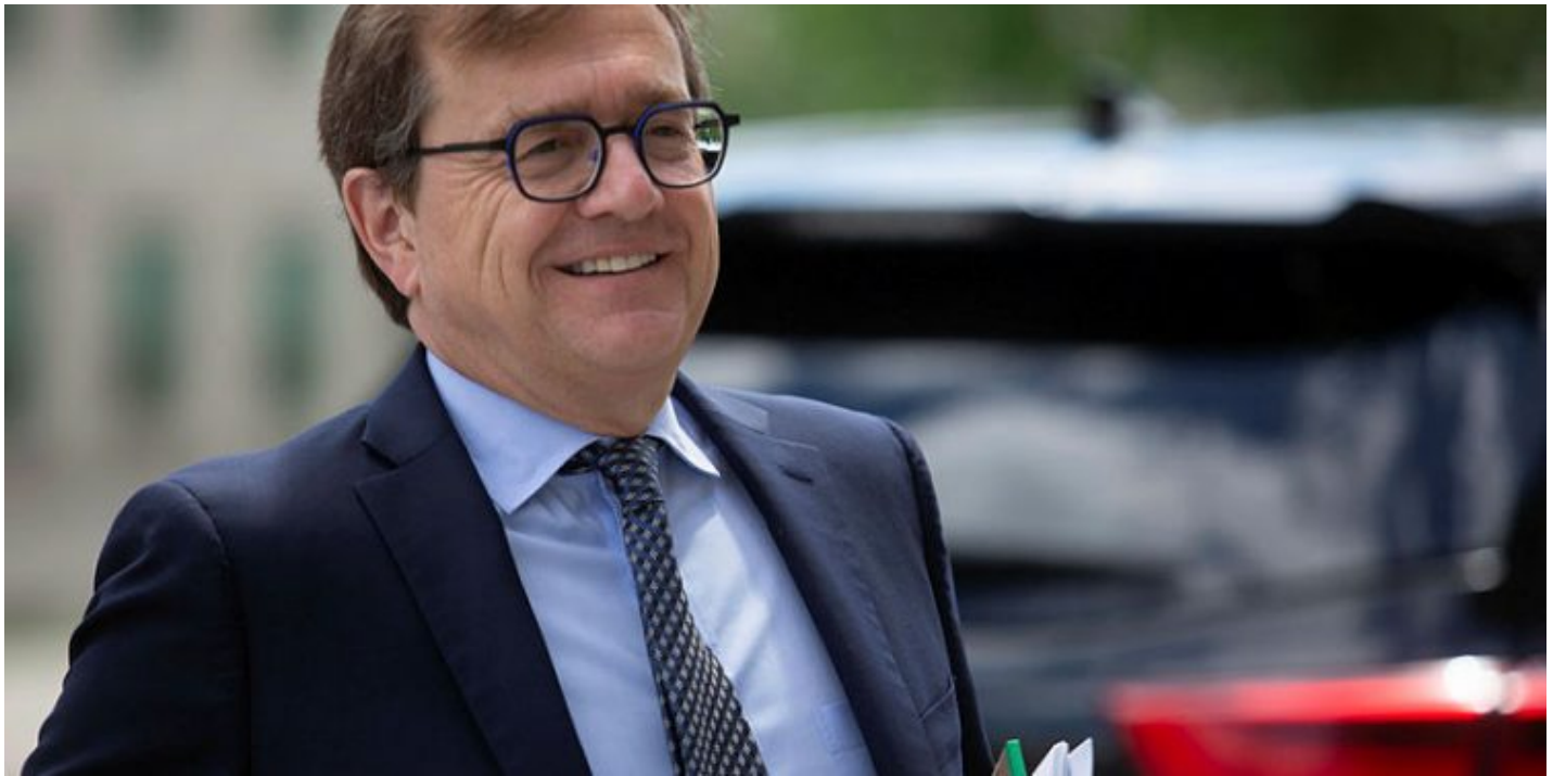
Natural Resources Minister Jonathan Wilkinson is likely aware of the risks of the transition to a green economy, which will be highly disruptive, changing the kinds of industries and jobs we need, and turning carbon-intensive assets into stranded assets.

f (https://www.facebook.com/sharer/sharer.php? u=https://www.hilltimes.com/2022/09/19/crane- canada- needs- to- rethink- its- zombie- identity- as- an- oil- and- gas- superpower/382731) and gas superpower&url=https://www.hilltimes.com/2022/09/19/crane-