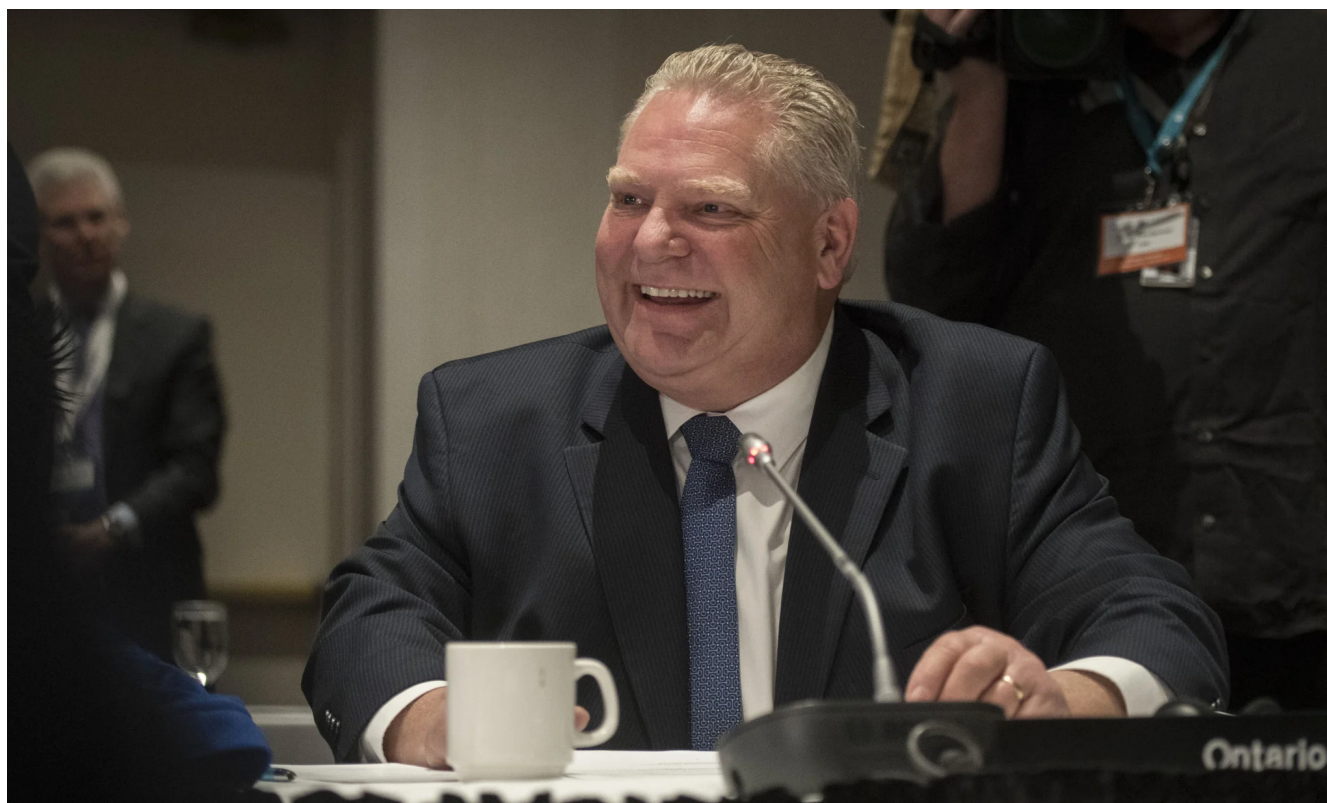
Ontario Premier Doug Ford at the start of the Meeting of Canada's Premiers event in Toronto on Monday, Dec. 2, 2019. Ontarians say climate action has a short-term cost.