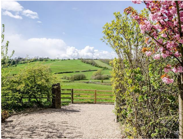
Lawn Area at the front of the property