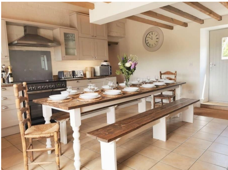
Kitchen and Diner Table