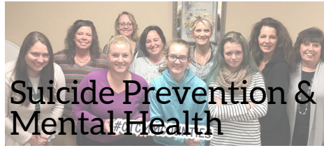
Suicide Prevention & Mental Health

Completed youth surveys were collected and submitted to the company, Bach-Harrison, to compile all results. They have been returned and will be reviewed at our next meeting in August. Meetings will be scheduled with the school districts to release & explain their data. This information is imperative to the CTC process and will give us fresh information for the next round of determining what our communities' highest risk factors are. Our next project involves creating a video highlighting the top three risk & protective factors and the programs selected.