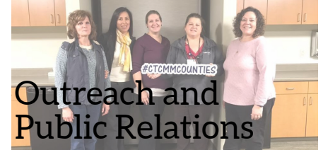
Outreach and Public Relations

This workgroup is planning three more YMHFA (Youth Mental Health First Aid) sessions through the school year. We are also going to add three showings of the Suicide: The Ripple Effect through the school year. Dates TBD. For both, we are trying to reach Menominee County and possibly Marinette County to reach a broader audience who can't always come into The Marinette/ Menominee City area. The Suicide prevention network has a walk "Embrace Life" on September 29