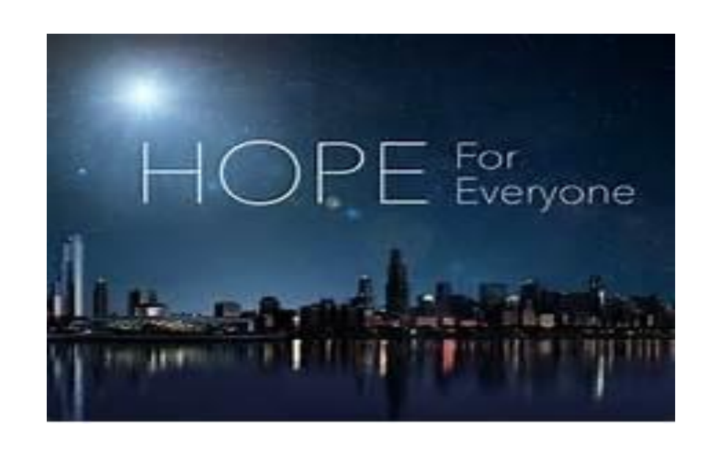
Our Goal: So, the world may know He is God; a church for everyone.