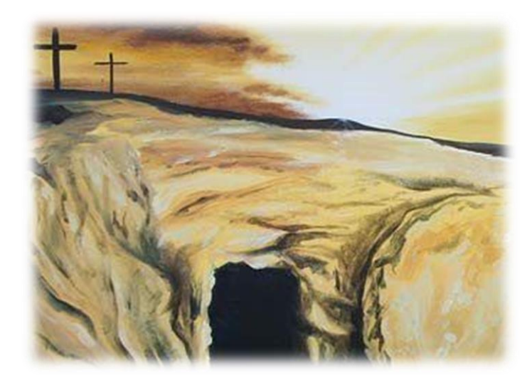
† Please stand as you are able