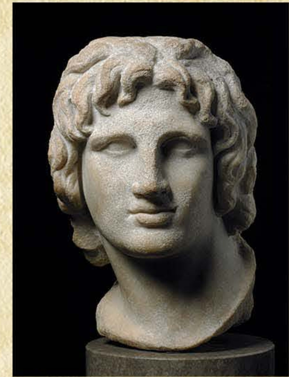
Alexander the Great

And the rough goat is the king of Grecia: and the great horn that is between his eyes is the first king. Daniel 8:21