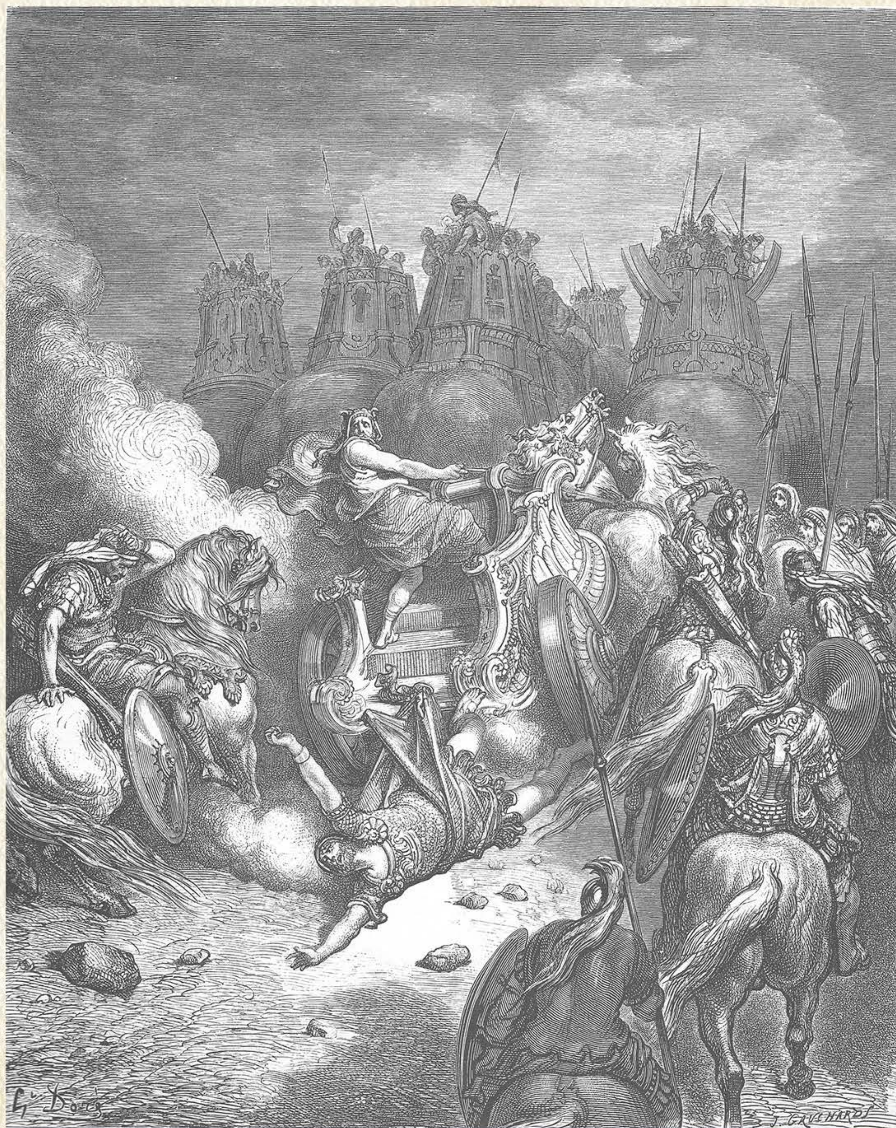
Punishment of Antiochus, engraving by Gustave Doré