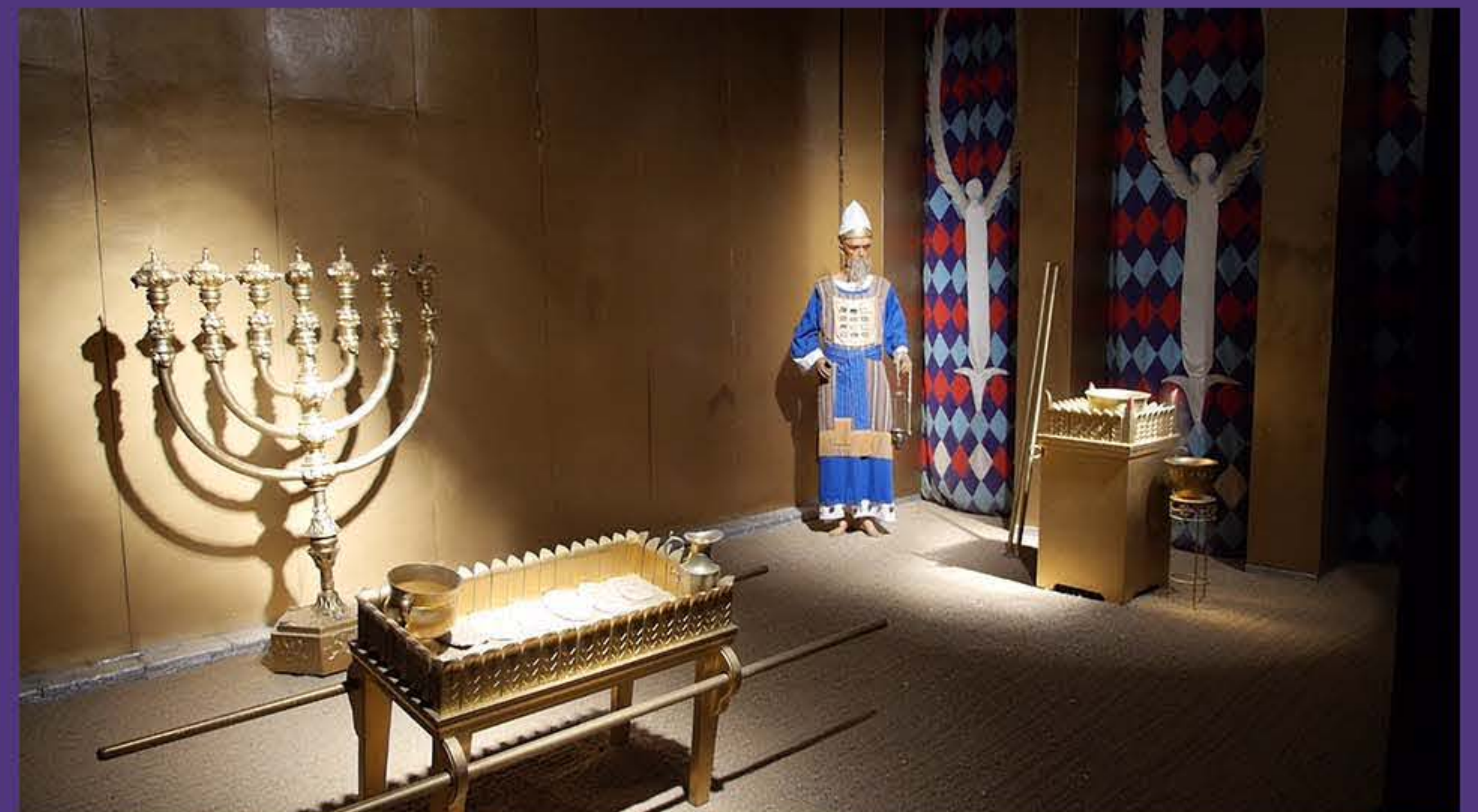
The Holy Place

...Then you shall bring the ark of the Testimony in there, behind the veil. The veil shall be a divider for you between the holy place and the Most Holy. Exodus 26:33