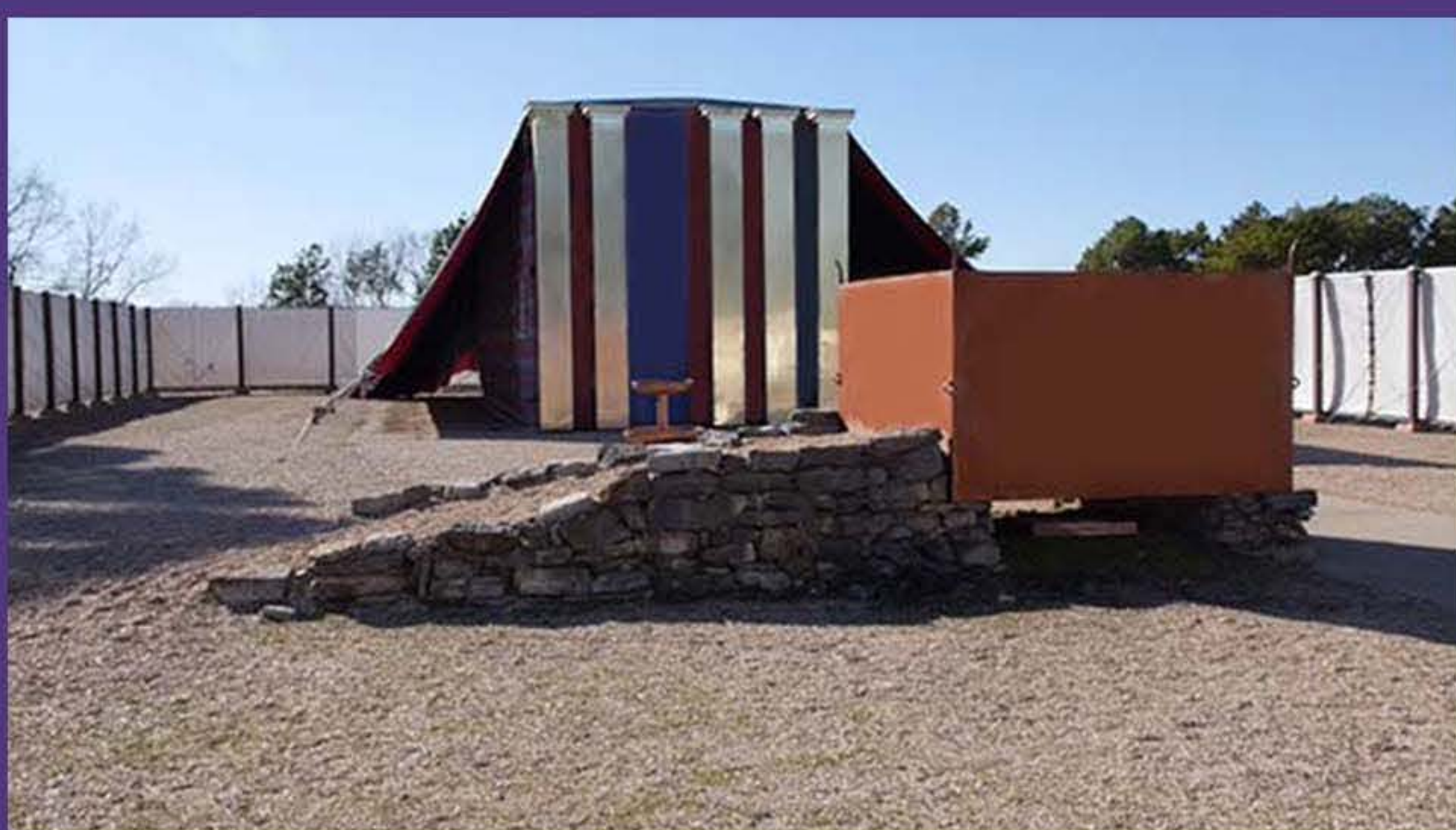
The Altar and Laver in the Outer Court