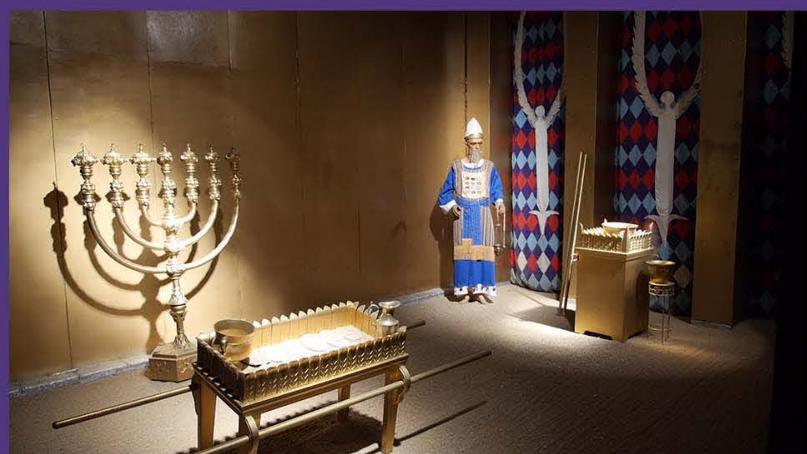
The Golden Altar in the Holy Place