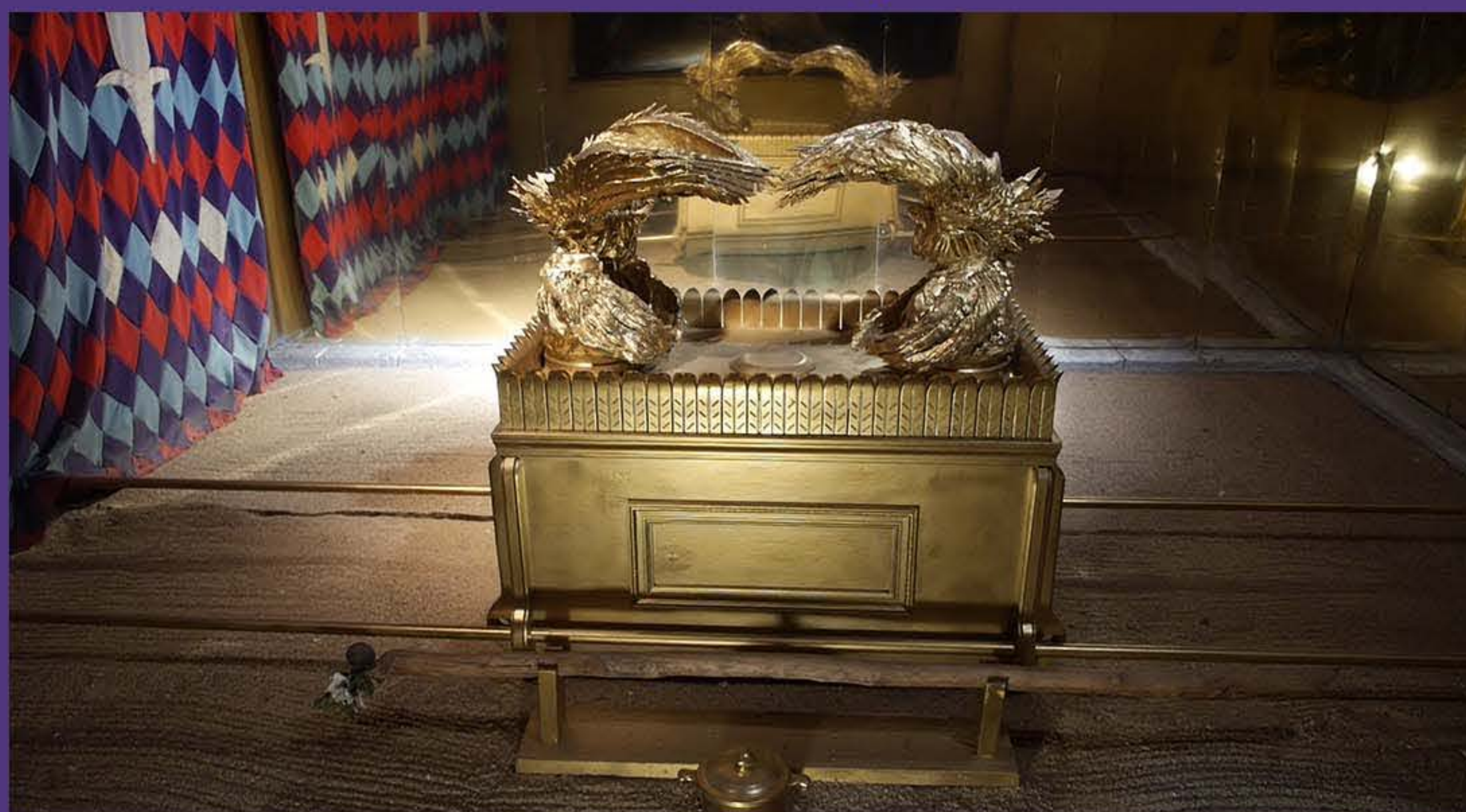
The Ark in the Holy of Holies