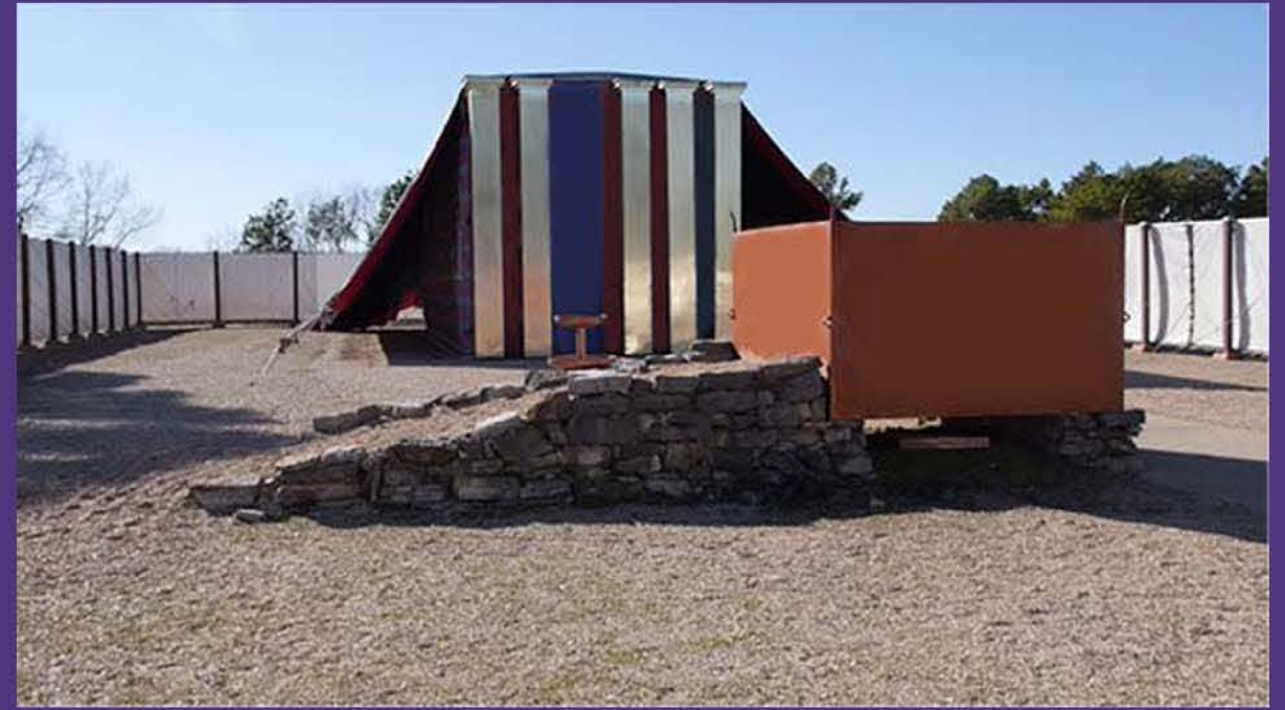
The Altar and Laver in the Outer Court

He set the laver between the tabernacle of meeting and the altar, and put water there for washing; Exodus 40:30