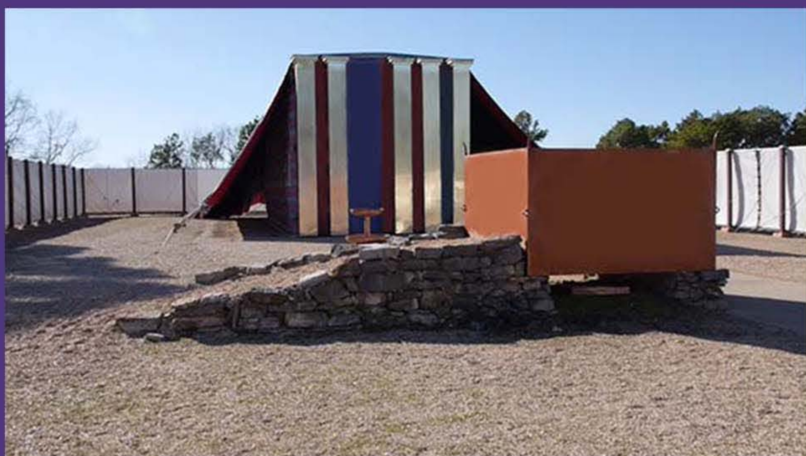
The Altar and Laver in the Outer Court

The Tabernacle also has a Golden Altar of Incense in the Holy Place. There will be more information about the Golden Altar later in this teaching.