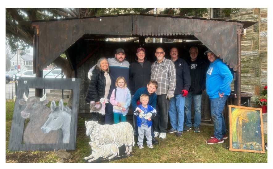
Some of our team from December 9th who helped with the manger.