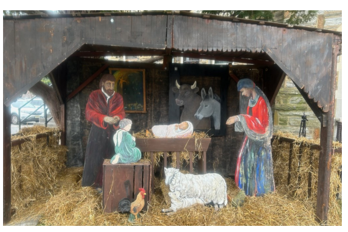
Celebrating 72 years!