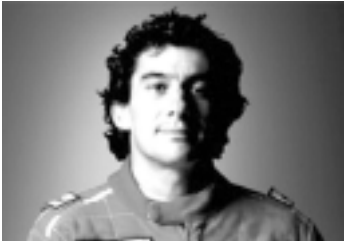
Formula One Focus by Brian Swope - 10