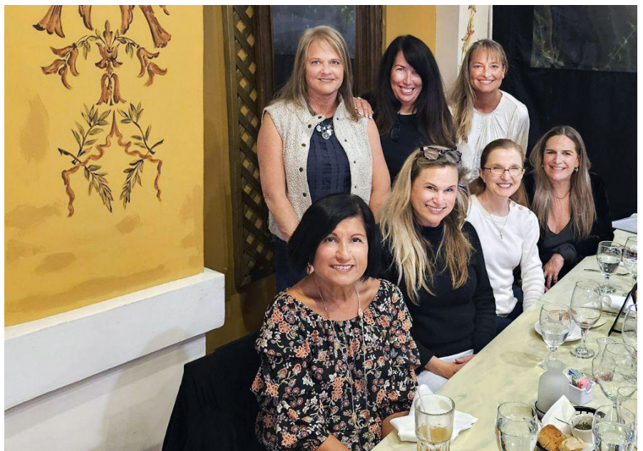
As always, there was lively and thought-provoking conversation at the AFTER DARK dinner event in April. Join us in May for more of the same.