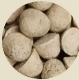
Ostrich & Coconut Biscuits