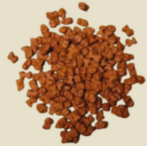
Pheasant & Sweet Potato Bites