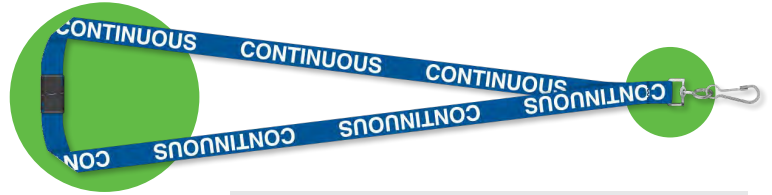
CONTINUOUS PRINTING IMPRINT CONTINUES THROUGH SEAM AND BREAKAWAY

CONTINUOUS PRINTING AND POSITIONAL PRINTING: Many lanyards come in either a continuously printed imprint or a positionally printed imprint. See diagram below for examples of printing styles.