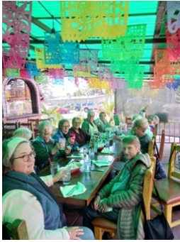
The Group of Diggers and Dividers celebrating & relaxing after finishing at Lewis's