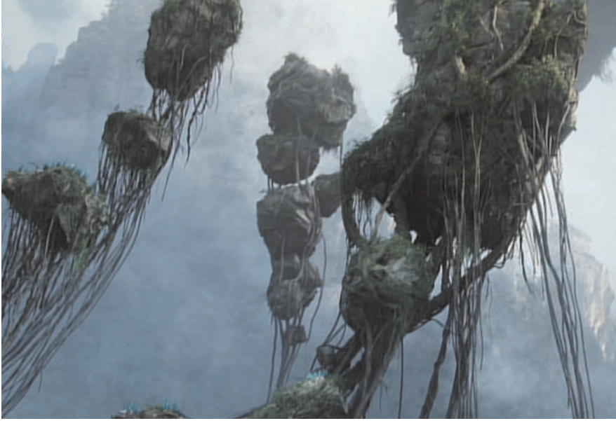
Figure 4 The floating mountains of Pandora (James Cameron, Avatar )

In Avatar , however, this linguistic and visual analogy is not only repeated but pushed to a new level by the effective employment of 3D filming technology. This technique visually enhances the representation of the Pandora jungle as a three-dimensional space that resembles the spatiality of an actual brain as a three-dimensional object: the kind of object the viewers have seen in the holographic projections of brains and neural pathways at the beginning of the film. The potential of these new cinematic possibilities is fully and spectacularly played out when Augustine's research team explores the 'legendary floating mountains' of Pandora by helicopter. Consisting of huge rocks and lumps of earth suspended in mid-air and connected by lianas and other plants, these 'floating mountains' visually resemble clusters of neurons (ganglions) and give a new dimension to the spatial experience of Pandora as a giant brain (Fig. 4). 79 The spectacular flight scenes and nose dives of the camera eye in Avatar therefore are more than just effective means of an action film to create thrill and excitement, they have an epistemological dimension as well: they visually superimpose neuronal and planetary spaces and thus contribute to the film's attempt to show the microscopic in the global and the giant in the small.