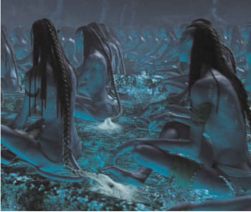
Figure 2 Gathering at the Tree of Souls (James Cameron, Avatar)