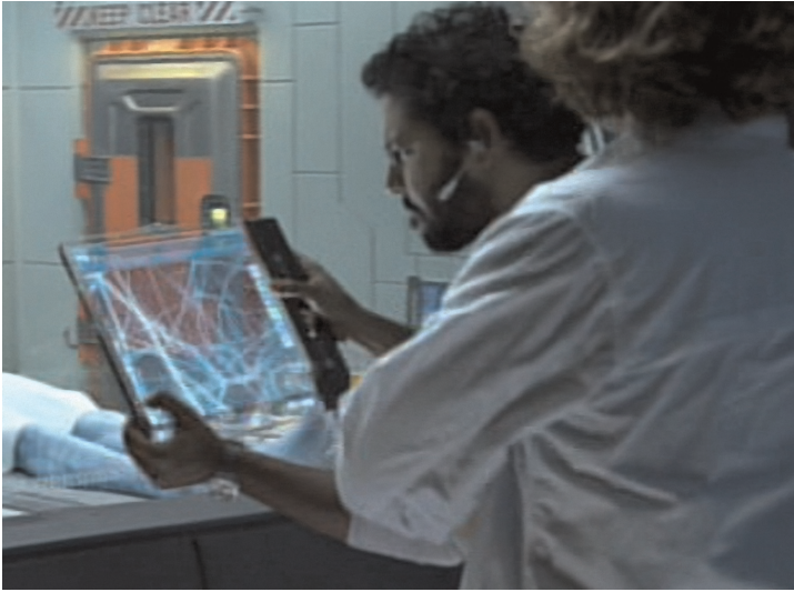
Figure 3 Scanning the brain, seeing networks (James Cameron, Avatar )

system’ and ‘stretch out in all directions like an overflowing brain’ themselves. 73 The most conspicuous instantiation of the network trope at the meso-level of humanoid and animal organisms is a psychobiological linking procedure called ‘the bond’ ( tsaheylu ). This bond is established when the Na’vi connect their long queues – hair-like extensions of their nervous systems – to other organisms such as the horse-like or dragon-shaped creatures of Pandora they use as means of transport. The form and look of the queues are clearly modelled on visual representations of nerve cells, with the braid resembling the elongated cell body ( soma ) and the fringy endings bearing a close likeness to dendrites, the branched projections of nerve cells named after the Greek term for ‘tree’ ( dendron ).