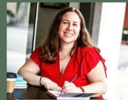
Bloom with Cara Coaching and Mentoring