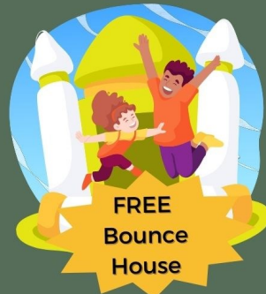
FREE Bounce House