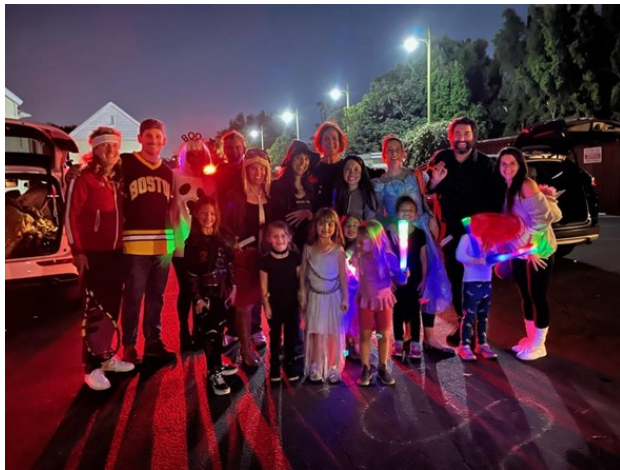
Alums participating in Trunk or Treat festivities...

Upcoming events for the Preschoolers in November include Pilgrim’s Vittles in Bower Hall at 5pm for the entire family preceding the long Thanksgiving weekend.