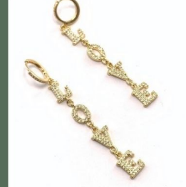
Hot Rocks Jewels