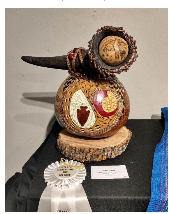
"Buffalo Grande" Sherry Nelson