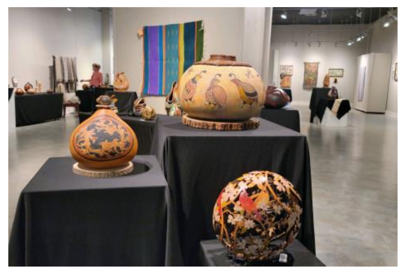
Kerr Arts and Cultural Center's 16<sup>th</sup> Annual 2022 Southwest Fine Art Gourd And Fiber Show