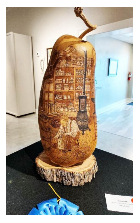
1<sup>st</sup> Place "Back In Time" Sherry Nelson