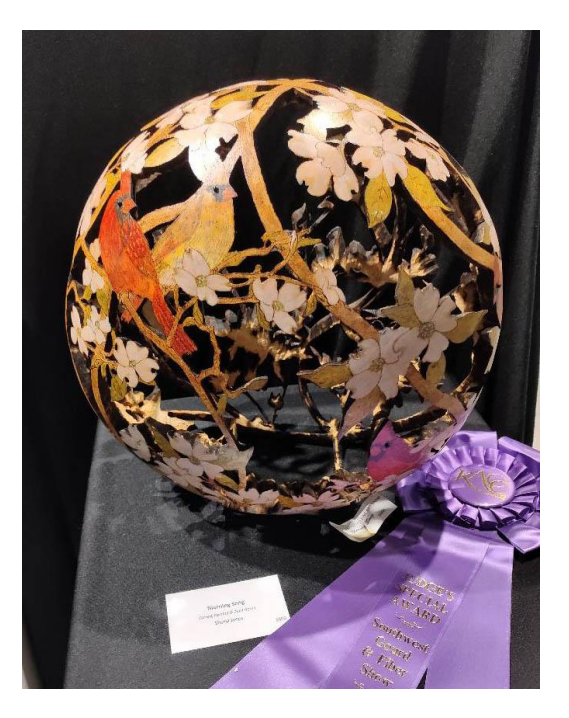
"Morning Song" Sheryl Jordan