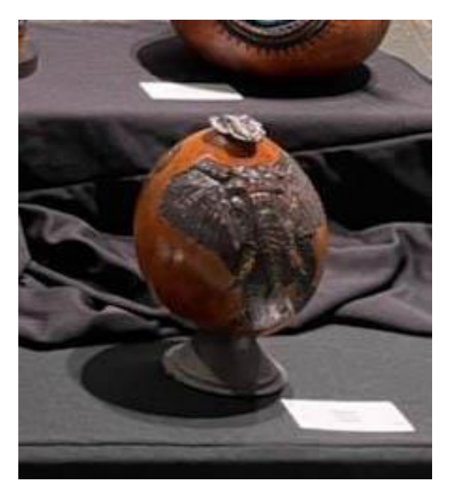
"Elephant" Connie Fox