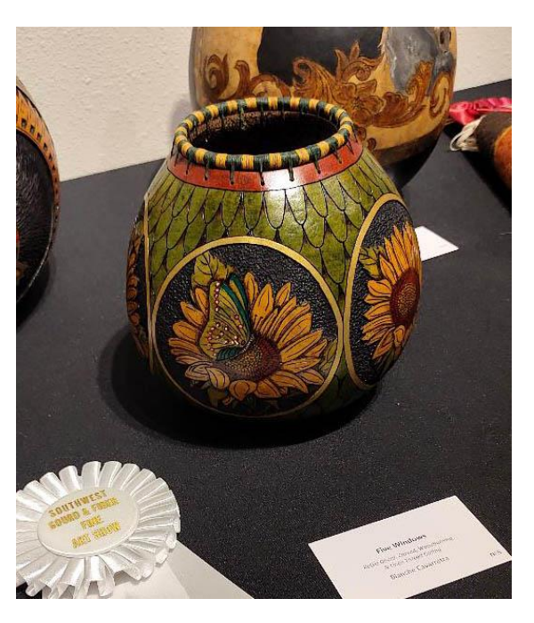
"Five Windows" Blanche Cavaretta