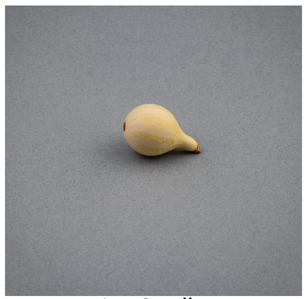
1rst Smallest Cathy West