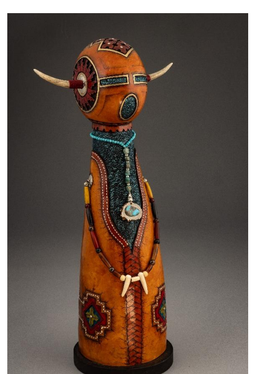
1rst Mixed Media-Roy Cavaretta