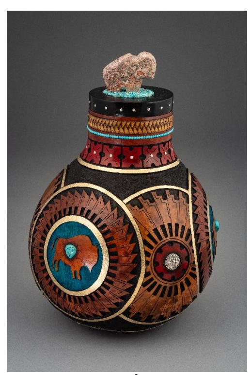
1rst Southwest Roy Cavaretta