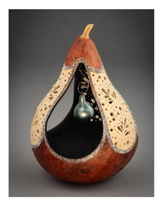
1rst Mixed Media Becky Query