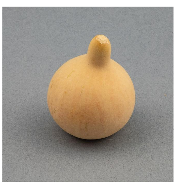
1rst Best Looking Dried Cathy West