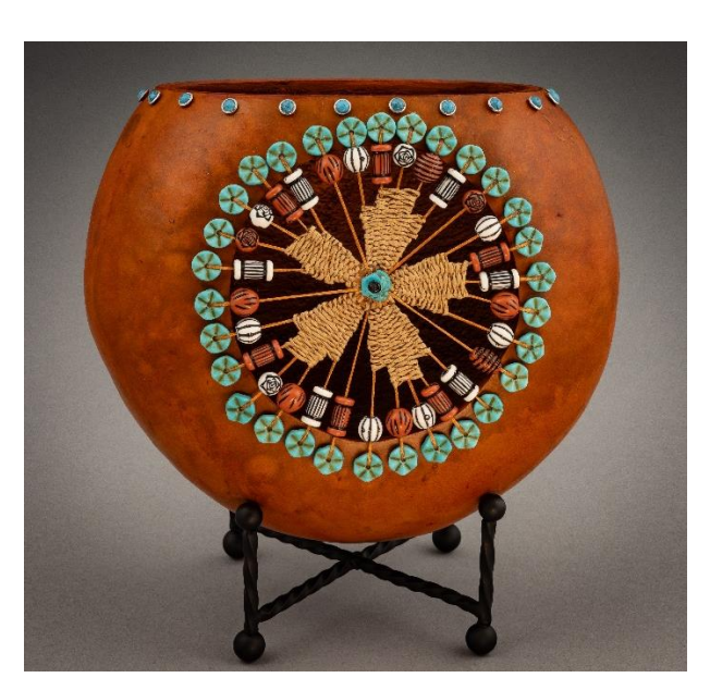
1rst Weaving Cathy West