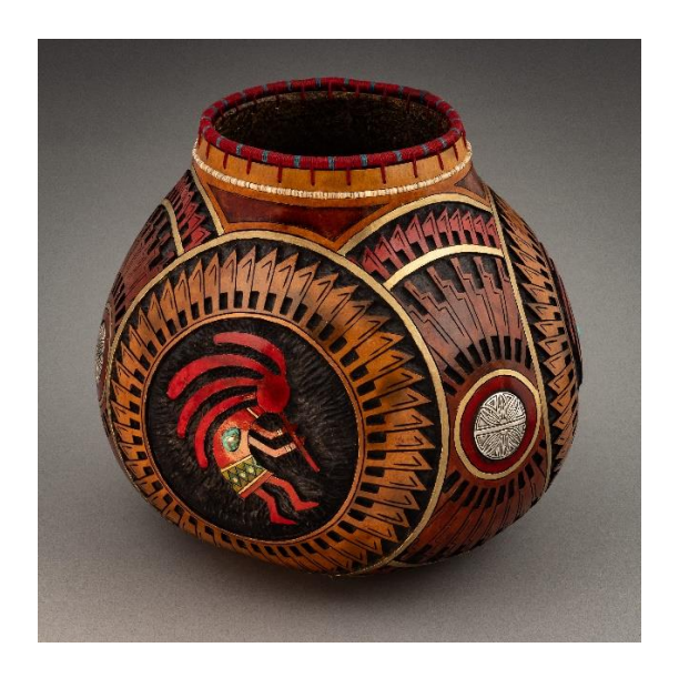
1rst Carving - Roy Cavaretta