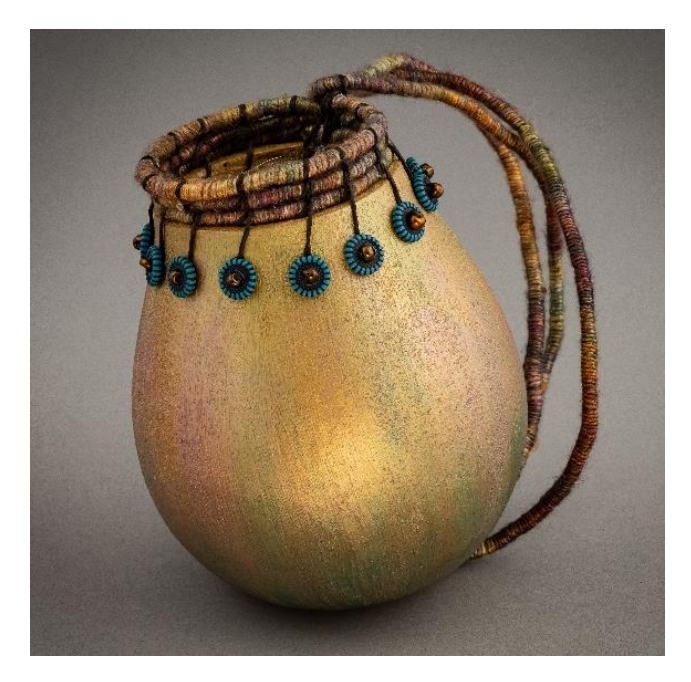
1rst Coiling Rica Brock