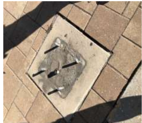
Before exposed bolts after pole removed