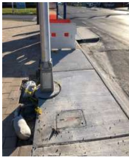
Zocalo Jan 29, 2021