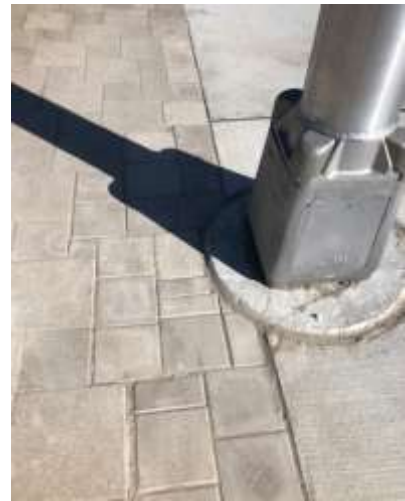
Zocalo Feb 8, 2021

Urgent Repairs on 2.15.21 Holiday: A&M Property Maintenance notified Staff on the Holiday of pipe break issues on N. Main Street within the FDOT project area resulting after heavy rainfall over the weekend. The issues were addressed by Wright Construction on the same day, and corrections have been completed for proper restoration.