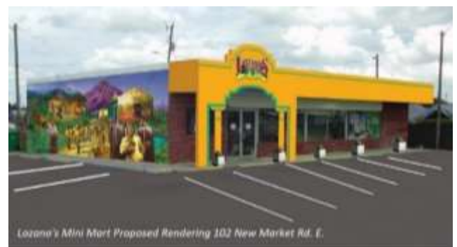
Lozano's Mini Mart Proposed Rendering 102 New Market Rd. E.

Staff met with Mini Mart owners to complete package for BCC submittal. No update.