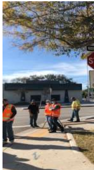
Walk Through 2.4.21