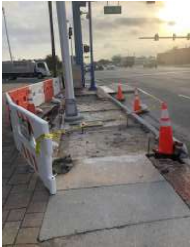
Zocalo Dec 4, 2020

FDOT replaced the concrete curbing and sidewalk from the installation of the new light pole.