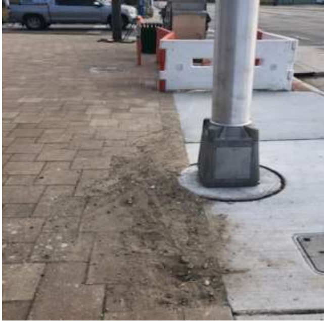
Before the FDOT Walk Through on 2.4.21 at Zocalo