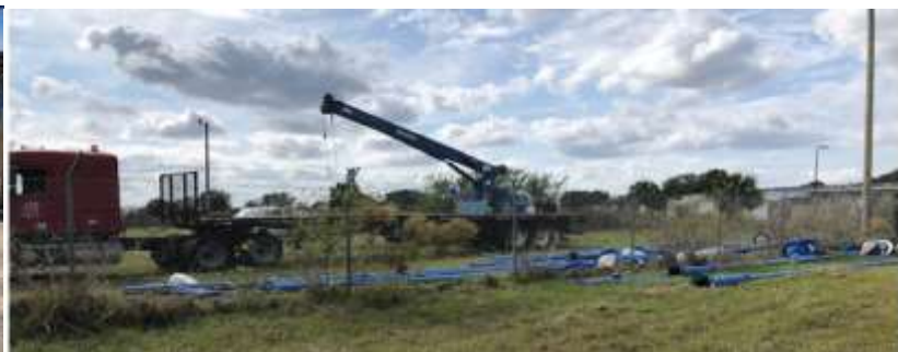
Blue Light poles from Main Street are being stored at the Immokalee Airport for future use.