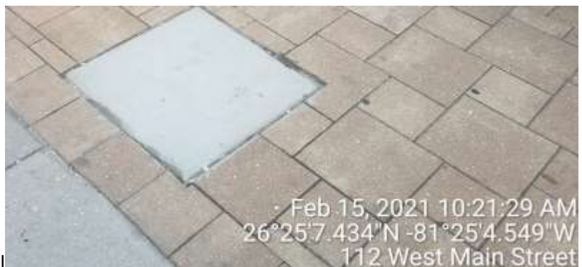
After the restoration of pole removal