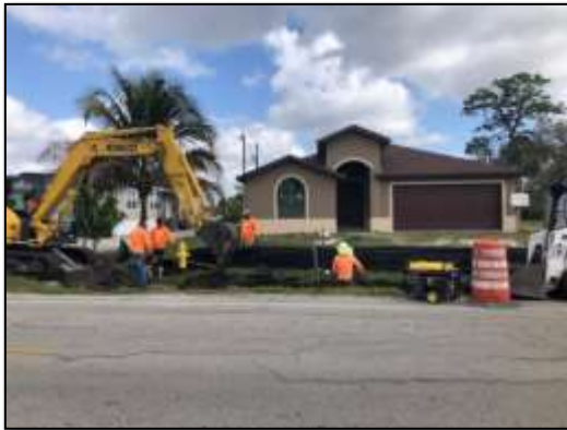
S 5 th St. and Carver St. on 2.8.21

In June 2020, through a competitive bid process Coastal Concrete Products LLC d/b/a Coastal Site Development (Coastal Concrete) provided certification as a Section 3 Business and was awarded the contract in the amount of $821,756.00 . Total project cost is estimated at $991,114.