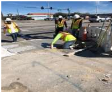
Main/1 st St 2.4.21