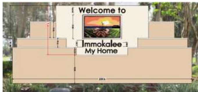
Lykins-Signtek approved sign for Triangle Welcome Sign