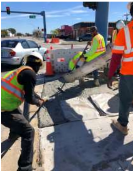
Sidewalk Pour Main/S 1 st St 2.4.21