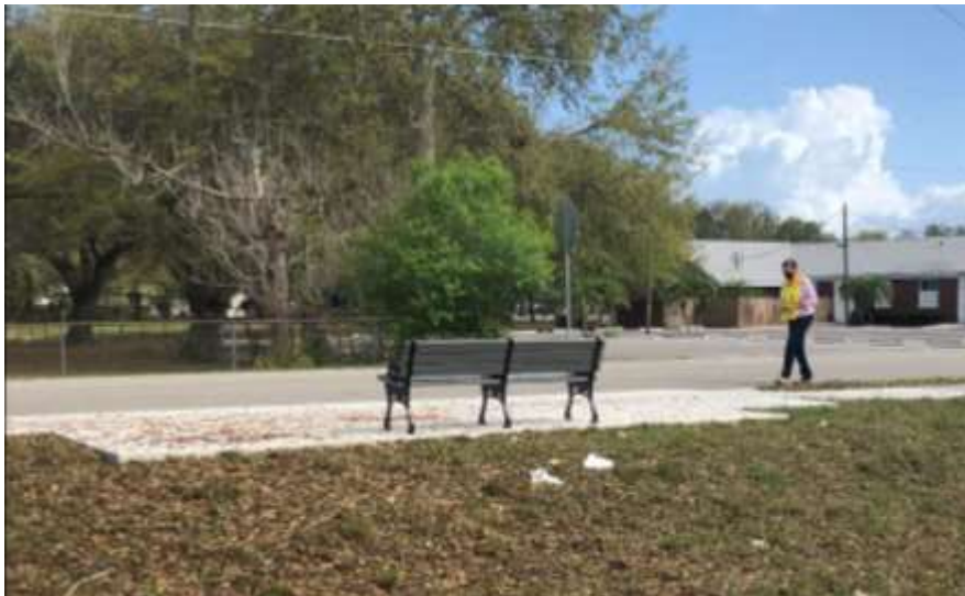
CAT at Roberts Senior Center 2.19.21