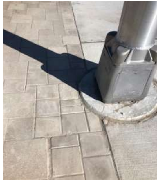
After FDOT Walk Through on 2.8.21 at Zocalo