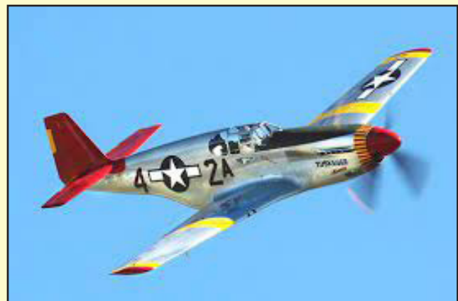
P-51 Mustang - the plane the Tuskegee Airmen flew with the distinctive "red tail"