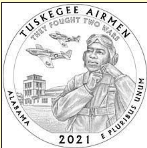
US Mint releasing Alabama's quarter honoring the Tuskegee Airmen in January 2021