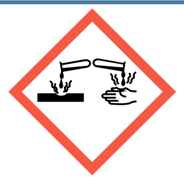
Signal Word: WARNING! - FOR HEALTH EFFECTS (Acute and Chronic): SEE SECTION 11