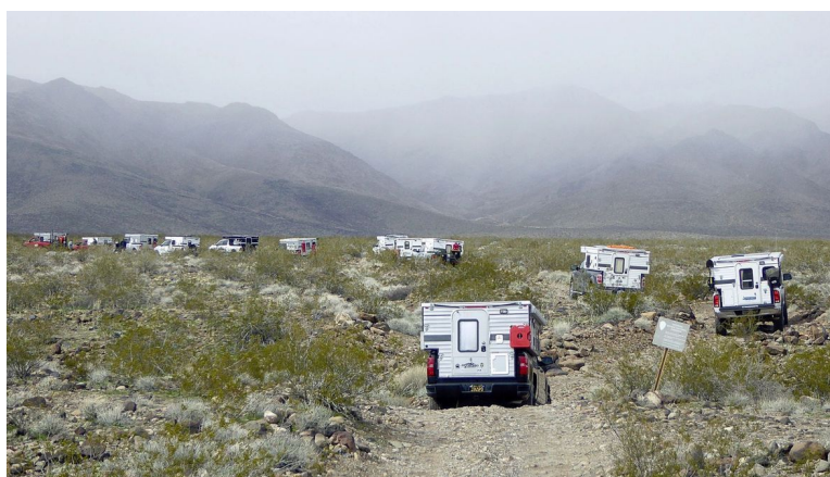
2019 Mojave Road Tour

Four Wheel Campers and Off-Road Safety Academy have again partnered in 2020 to offer owners of their campers several overland adventure tours. If you are a Four Wheel Camper Owner and have a 4WD truck, you can still sign up for Tours.