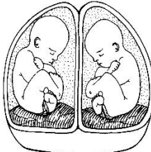
Dichorionic/Diamniotic (Fused Placenta)