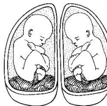
Dichorionic/Diamniotic (Separate Placenta)

Di/Di twins are by far the most common type and have the fewest complications. Mo/Di twins have the challenge of sharing the placenta, where one baby can receive much less than its share of needed nutrients. Mo/Mo twins can become entangled with each other. If you have Mo/Di or Mo/Mo twins, we will need to transfer your care to a Maternal-Fetal Medicine (high-risk) physician group.