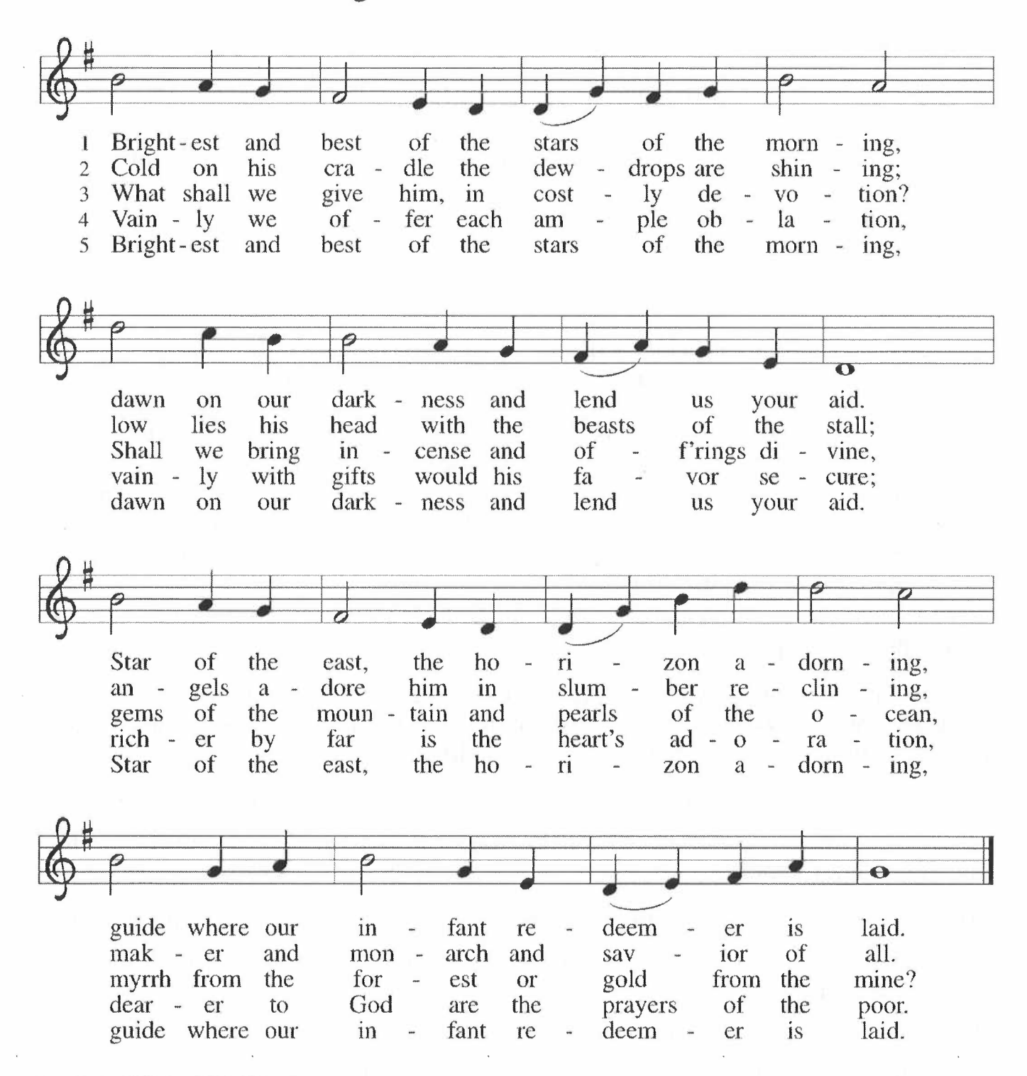
Brightest and Best of the Stars