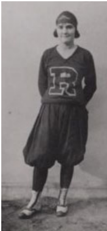
Nevada State Museum