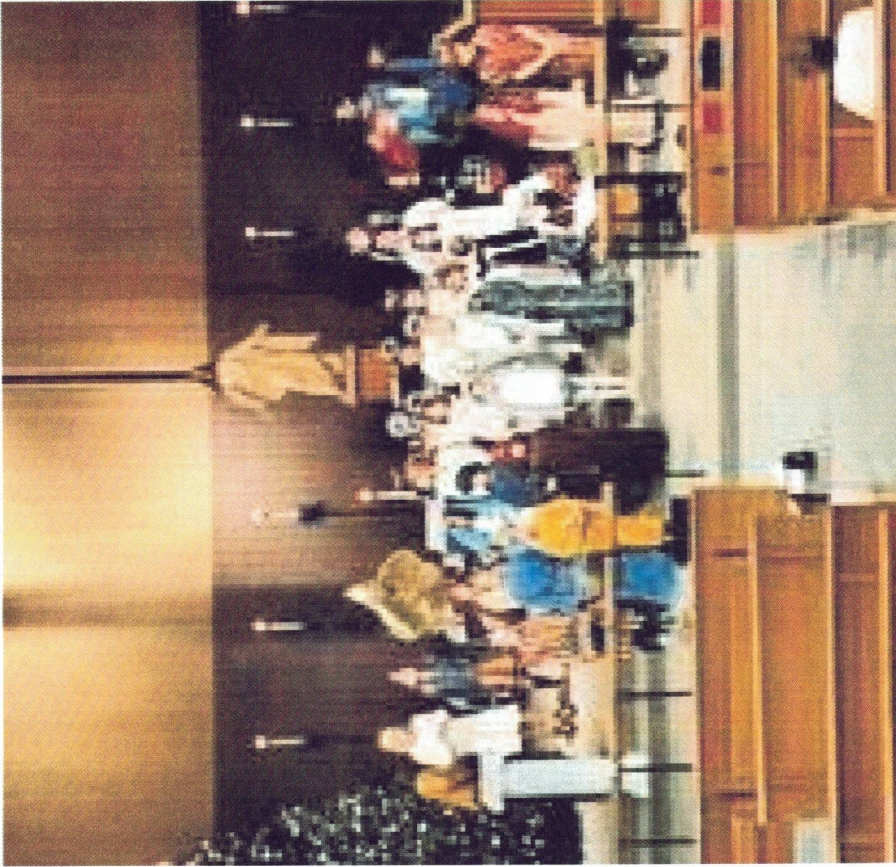
Sunday School Christmas Program at Our Savior's on Sunday, December 3, 2023

Trinity Lutheran Parish Monthly Newsletter: Mona & Six Mile Grove Lutheran Churches